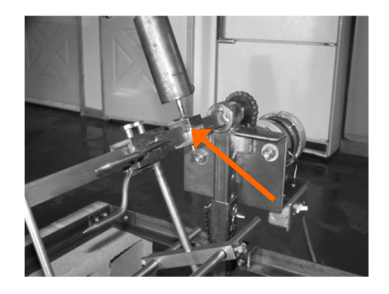
2) Slide Counter Weight onto spit, from open end of rod, opposite side of cradle.

Place angle iron frame on cinder blocks or fire pit. (1) Insert stanchion risers into brackets and secure in place with peg and cotter pin;