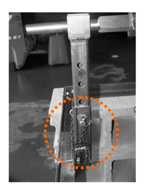
1) Frame Stanchion bracket, with stanchion secured by peg and cotter pin.